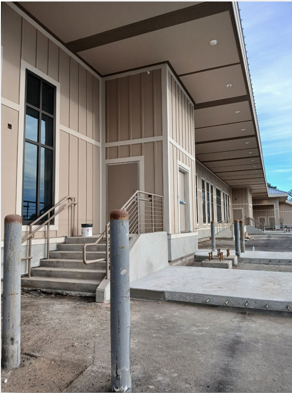
REAR EXTERIOR VIEW